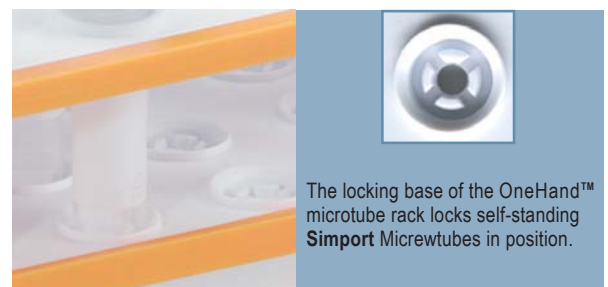
The locking base of the OneHand™ microtube rack locks self-standing Simport Microwtubes in position.