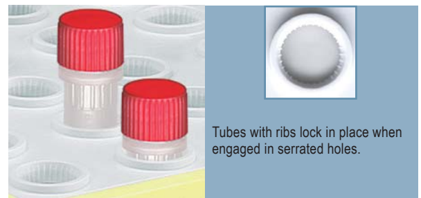
Tubes with ribs lock in place when engaged in serrated holes.