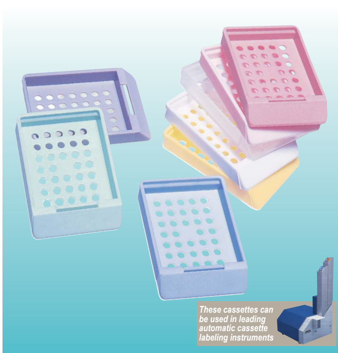
These cassettes can be used in leading automatic cassette labeling instruments